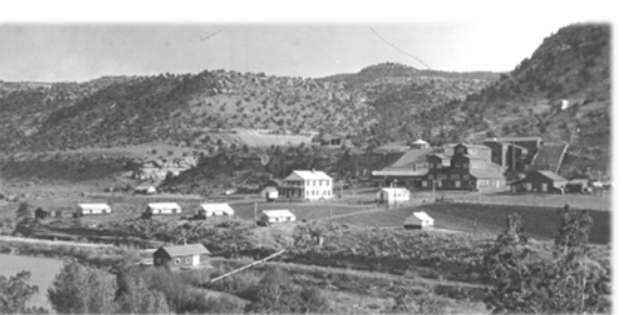
Uravan showing Boarding House, Joe Jr. Mill. C. 1915