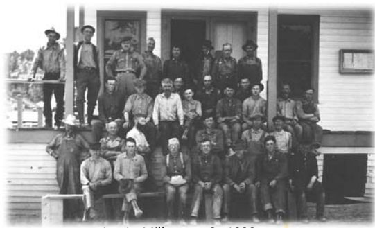
Joe Jr. Mill crew. C. 1920

1928: U.S. Vanadium Corp. (USV) acquires the plant and operates 900 local mines. 240 tons of ore processed each day for vanadium, used in hardening steel. 4,000 workers in the total operations.