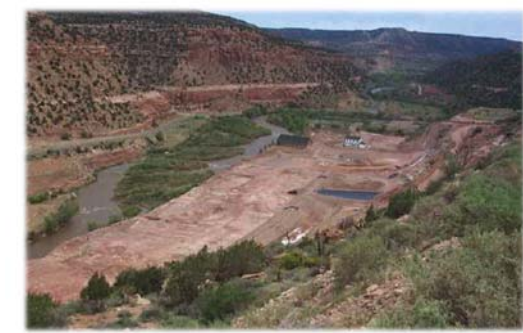
Uravan 2000, Boarding House upper right.