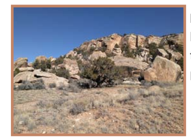
In this photo, the large boulder on the right is the petroglyph rock.

Leaving Naturita, west on Highway 141, turn onto Highway 90 heading west for about 5 miles to mile marker 29. Turn left (south) onto county road EE22. Drive about 1/2 mile, passing through 2 gates; then turn left on the first 2-track to the left. Continue for about another 1/2 mile, heading toward the rock walls to your left. The road continues up to the panel, but you can park your vehicle at any time and enjoy a nice hike.