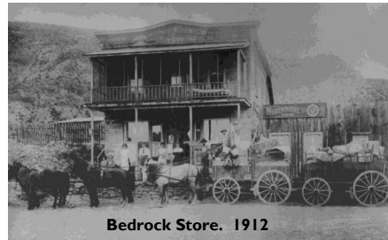
Bedrock Store. 1912

MM 15.1 (West on Hwy 90) Y9 Rd begins at the old Bedrock Store. Bedrock boomed between 1899-1908 when copper and silver were discovered and mined at the Cashin Copper and Cliff Dweller mines, 4 miles west. During its heyday the town boasted two hotels, two saloons, a store, and 500 residents.